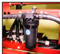
Inline Boom Filters