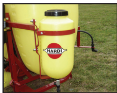
Clean Water Dispenser