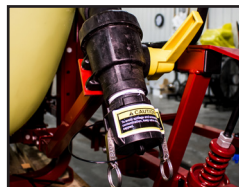
2" Quick Fill