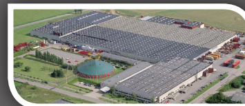
Nørre Alslev, Denmark